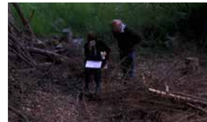
O TERMÓMETRO DE GALILEU GALILEO'S THERMOMETER