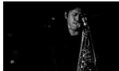
BARULHO, ECLIPSE UPROAR, ECLIPSE